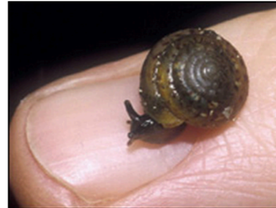
Experts will study the snails' breeding and feeding habits

A colony of rare snails is settling into its new home at London Zoo as part of a mission to save the species from extinction.