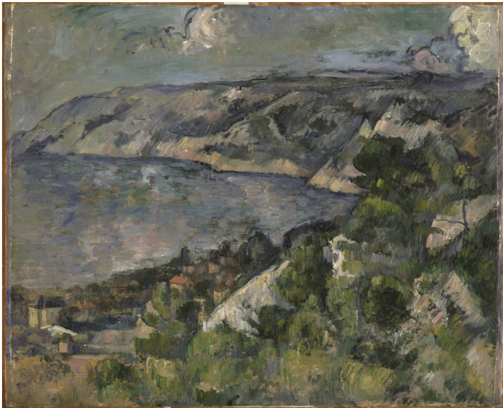
Fig. 8. Paul Cézanne and Claude-Émile Schuffenecker, Estaque Bay , 1879–83. Oil on canvas. Philadelphia Museum of Art. [Philadelphia Museum of Art]

Schuffenecker owned all three Cézannes he “finished” at some time before 1904. Estaque Bay was painted between 1879 and 1883 (fig. 8), Grand pin et terres rouges (Bellevue) in 1885 (fig. 9), and Madame Cézanne en robe rayée between 1883–85 (fig. 10). About Grand pin et terres rouges (Bellevue) , Walter Feilchenfeldt and Jayne Warman, the authors of Cézanne’s catalogue raisonné, remain puzzled: “[w]e still have not elucidated the question of the signature in the lower right corner of the painting. Since the painting was unfinished and, moreover, Schuffenecker had suggested that he himself had filled in the right side, one is therefore entitled to wonder if Cézanne would have really signed in the empty corner of an unfinished canvas. Rather, we believe that Schuffenecker signed off to complete what he had started” (“Cézanne et Schuffenecker”).