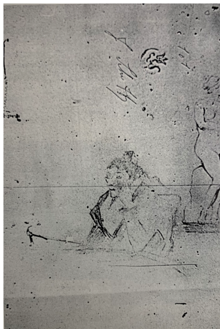
Fig. 4. Claude-Émile Schuffenecker, The Arlésienne (after van Gogh), Pencil on paper. Private Collection. [Grossvogel, Catalogue Raisonné 9]

Raisonné 92; fig. 6). Both Schuffenecker copies are signed or marked with the studio stamp or both.