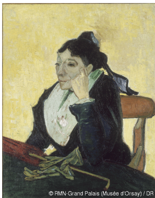
Fig. 5. Vincent van Gogh, L'Arlésienne: Madame Ginoux with Gloves and Umbrella , 1888. Oil on canvas. Paris: Musée d'Orsay. [Musée d'Orsay]