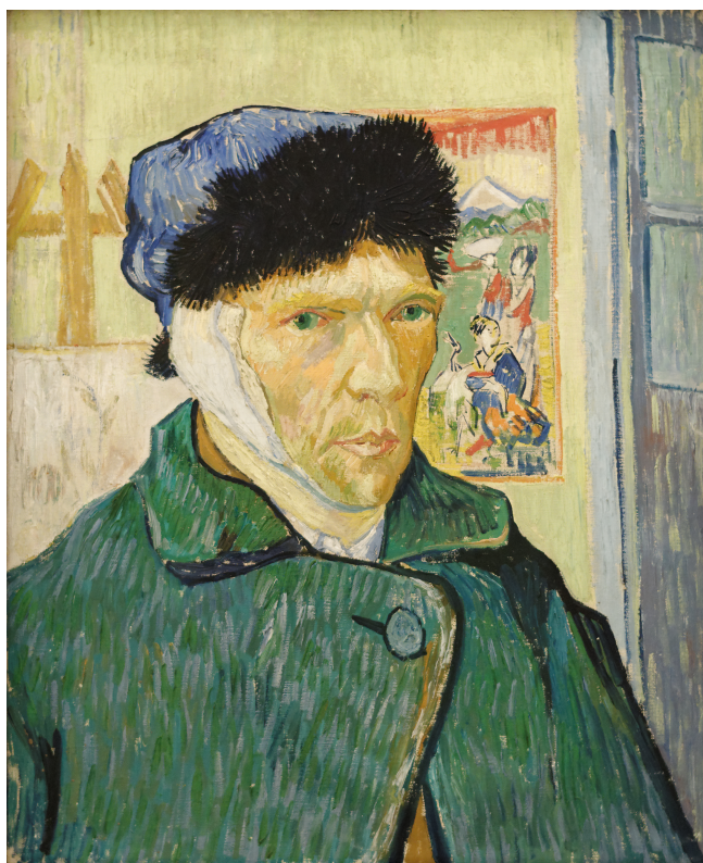
Fig. 7. Vincent van Gogh, Self-Portrait with Bandaged Ear , 1889. Oil on Canvas. London: Courtauld Gallery.

van Gogh before 1900? There was little money to be made as van Gogh was still largely unknown.