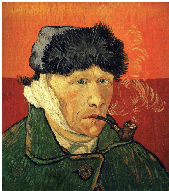
Fig. 3. Vincent van Gogh or Claude-Émile Schuffenecker, Self-Portrait with Bandaged Ear and Pipe , 1889. Oil on Canvas. Private Collection. [Born and Landais 139]