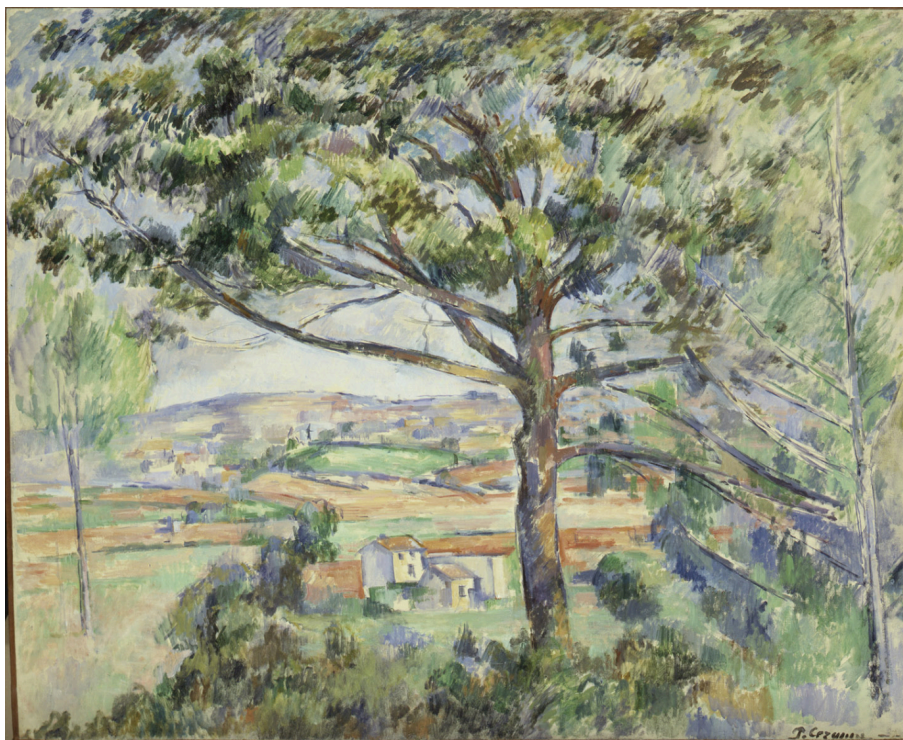
Fig. 9. Paul Cézanne and Claude-Émile Schuffenecker, Grand pin et terres rouges (Bellevue) , 1885. Oil on canvas. Private Collection Japan. [Feilchenfeldt, et al.]