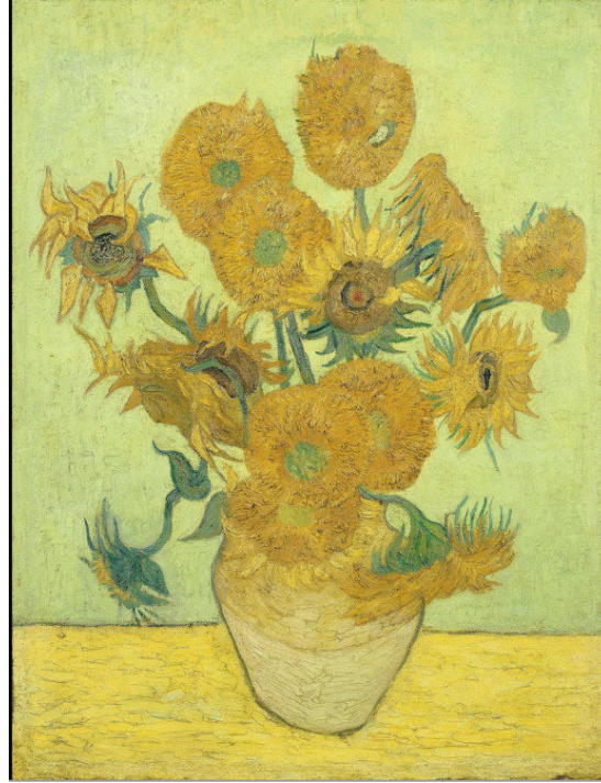
Fig. 1. Vincent van Gogh or Claude-Émile Schuffenecker, Sunflowers, 1889. Oil on canvas. Tokyo: Sompo Museum of Art.